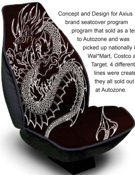
Concept and Design for Axius brand seatcover program program that sold as a test to Autozone and was picked up nationally in Wal*Mart, Costco and Target. 4 different lines were created, they all sold out at Autozone.