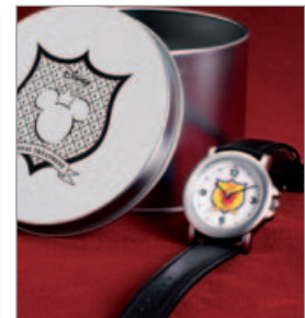
Photo art direction for fashion, collectibles, Best Guest loyalty programs and specialty books. Contributed work to Disney Catalogs, packaging design in Wal*Mart, Costco, Target and many more retailers.