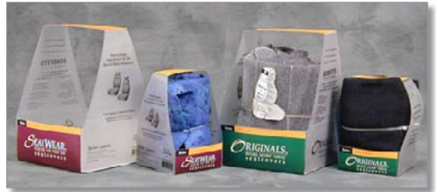
Concept and Package Design for Axius brand seatcovers and other various products, sold in national automotive chains and Wal*Mart and Costco. Concept and Design of Toyota Truckbuilder sales kit package design. Distributed to all Toyota Sales teams across America.