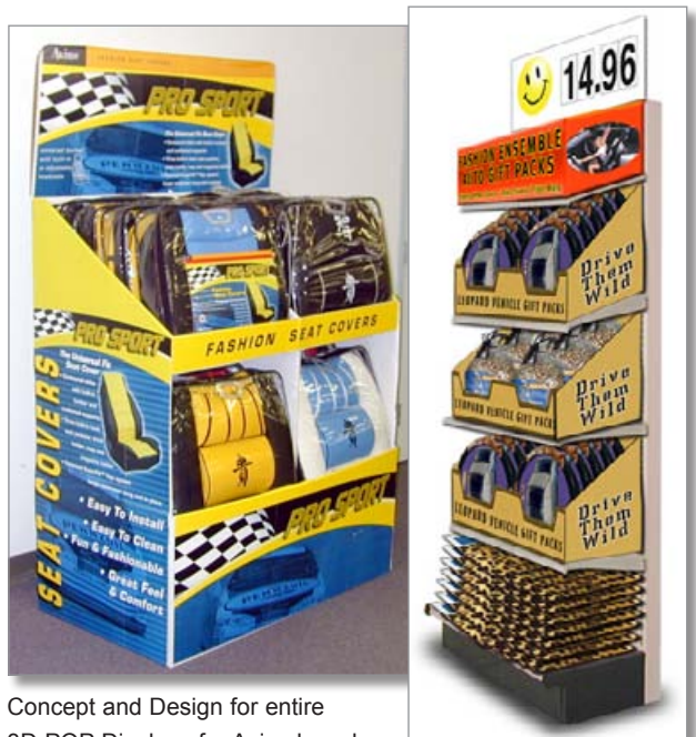
Concept and Design for entire 3D POP Displays for Axius brand seatcover program sold nationally in Wal*Mart, Costco and Autozone.